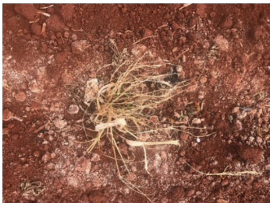
Photograph 1: Steadfast (60 mL/100L) + Biffo 200 SL (3000 mL/ha), 14 DA-A

Steadfast at 60 mL/100 L tank mixed with Biffo 200 SL had superior control of Crowsfoot grass compared to Biffo 200 SL applied alone at 7 and 14 DA-A.