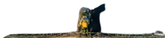
After cleaning with Steadfast