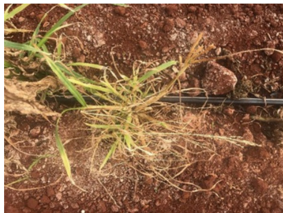
Photograph 3: Biffo 200 SL (3000 mL/ha), 14 DA-A