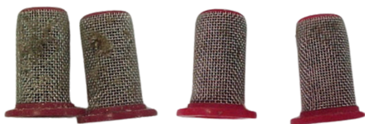
Before cleaning with Steadfast